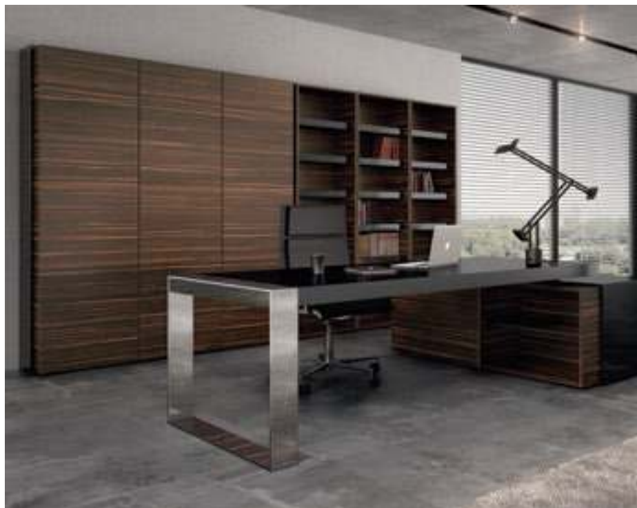
PISARNIŠKO POHIŠTVO VST OFFICE FURNITURE VST